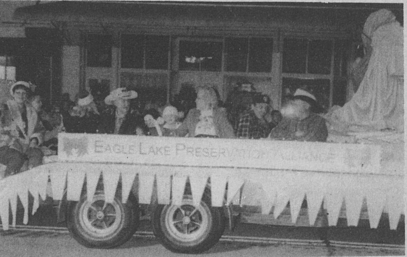
New organization, entry

One of the riders on the Eagle Lake Primary School (ELPS) PTO's entry snows off the trophy for first place in the schools division during Saturday night's parade.