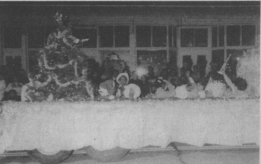
ELPS PTO takes first place

Cadets from the Colorado County Juvenile Detention Center (Boot Camp) took first place in the marching unit division of Saturday's parade as they presented the colors and performed precision drills.